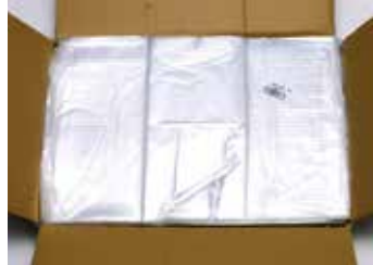
The Elkay Way

Most of Elkay's case-packed bags 15 inches wide and under are packaged in individually-labeled inner dispenser packs for convenience, protection and to reduce waste.