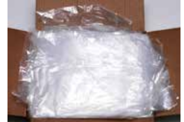
A Leading Competitor

Ask yourself: Which of these "identical" products would your customer rather package their food products in?