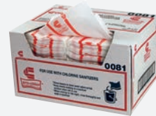
CHIX ® Pro-Chlor ®