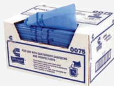
CHIX ® Pro-Quat ®